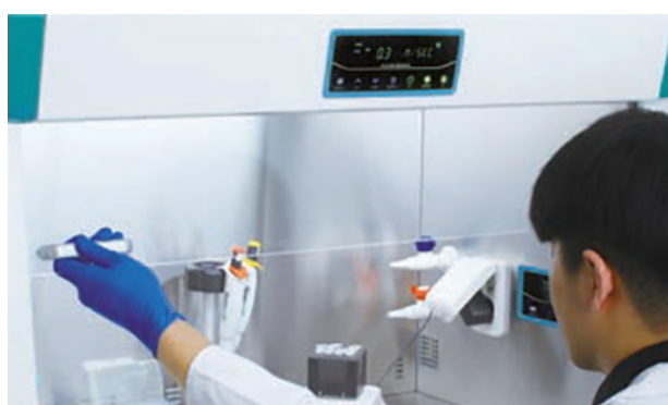
Interlocking smart door system